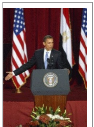
President Obama makes his case in Cairo: The ripple effects of the speech continue to be felt around the world.

As I write this note, it's still Election Day in Italy and elsewhere [E.U. elections]. And out of the votes of so many different peoples, the shadowy profile of meaning will emerge, definable beneath the surface of our collective unconscious - and we'll "draw the happy omens" if we scrutinize the viscera. [Editor's Note: This is reference