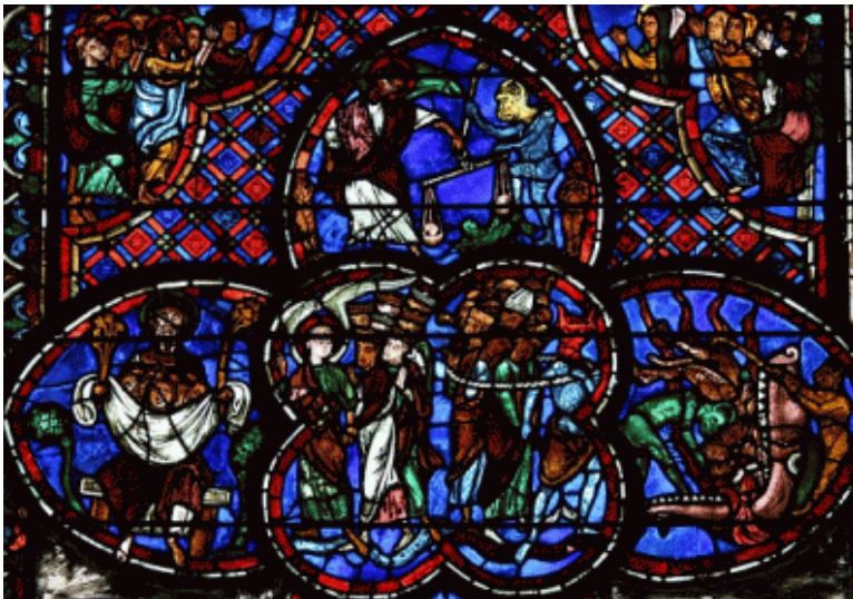
The Weighing of Souls and division of the blessed and the damned,

[Editor's Note: According to Wikipedia, judging the weighing of souls after death is an image of Christian theology and of some other religious traditions, according to which, the weighing of souls - the division of the blessed and the damned - is supposed to take place at the "end times." The author implies that the Vatican prefers monotheist Muslim souls to those of secular Europe].